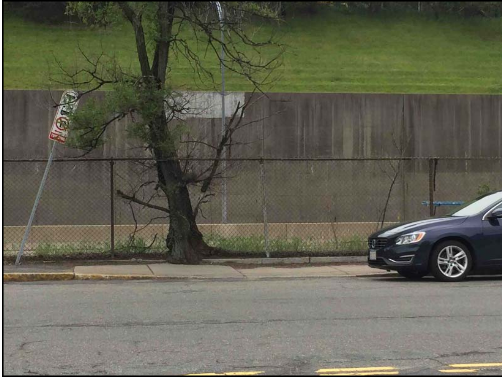
Curb cut at a MBTA Bus Stop, Washington Street at Armory Street